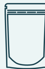
Mono-material flexible PE